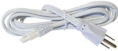
Power Cord (included) 3ft Power Cord