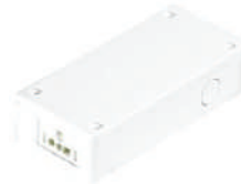
Junction Box (optional) Hardwire Accessory