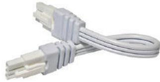
Jumper Cables (optional) Link undercabinet fixtures together. Available in 6", 12", 24" sizes. Available in white or black finish.