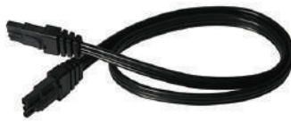
Item #: UC-JUMP-(6'/12'/24')-(W/B)