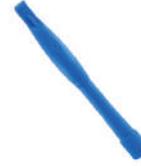
Flat Tool (included) Easily open flap for hardware and knockout access